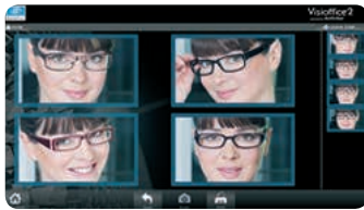
Drag and Drop to Compare