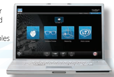
Software on Laptop

Your Visioffice 2 software and patient files can be easily accessed from your dispensing tables to expand the reach of your system. With the purchase of additional system software licenses, you can connect your computers to the system, allowing for demonstrations and fast lens boxing at your dispensing tables on busy days.