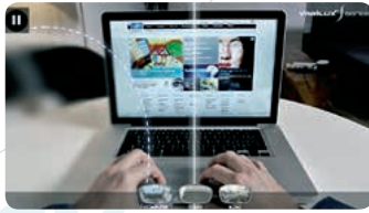
Personalized Lens Demos