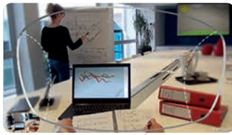
Lens and Treatment Demos